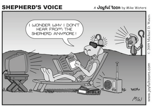
My sheep listen to my voice; I know them, and they follow me. _{\rm -\ JOHN} 10:27 _{\rm NIV}